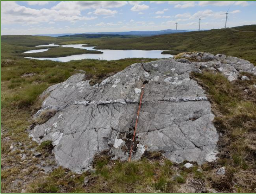
Plate 8.1: Example of Rocky Outcrop with Quarzitic Vain (Scale: Orange depth probe in shot = 1.9m, Orientation: Looking east, Lough Golagh in background)