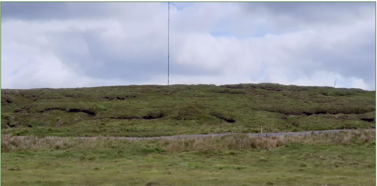
Plate 8.7: Linear features indicating potential for soil creep (Looking north / north east, existing met mast)

With reference to Chapter 9: Hydrology and Hydrogeology , weather conditions and rainfall which occurred on the Site in 2018 can be viewed as a natural stress test in terms of slope stability. A prominent landslide trigger mechanism for peat in Ireland is the sudden onset of high rainfall events after prolonged dry periods. Whereby, prolonged periods of dry weather cause the peat to dry and contract causing tension cracks and newly introduced fissures and pores, when rainfall increases, particularly during heavy rainfall events, said cracks, fissures and pores accelerate the infiltration of water into the peat, potentially lubricating failure plains, increasing pore water pressure and triggering sudden mass movement in the form of landslides. In 2018, Ireland experienced absolute drought conditions at 21 stations at various times between the 22 May and 14 July. As per Chart 9.2 – Rainfall Trends (Chapter 9: Hydrology and Hydrogeology) the region associated with the Development experienced generally drier than average conditions between March and July 2018, with wetter than average conditions in the following months, August and September