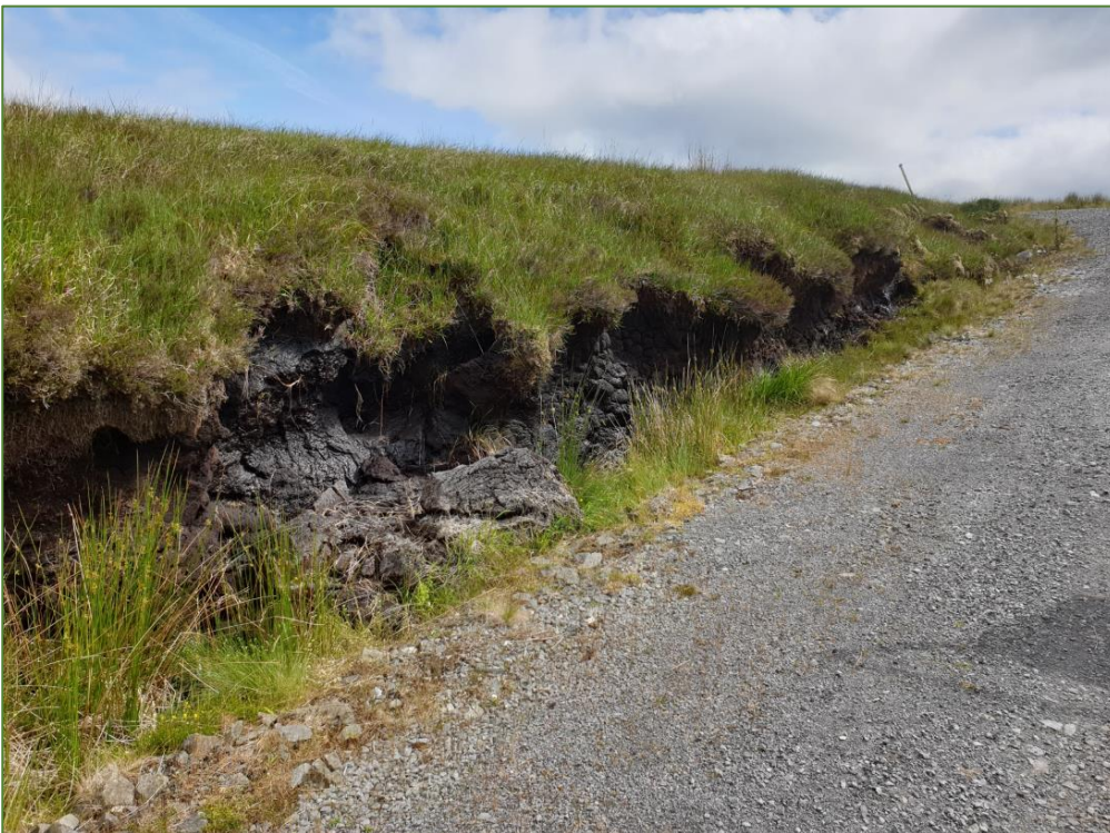
Plate 8.5: Example of soil creep evident along existing Site track i.e. overhanging peat

Indications of soil creep were observed and noted during Site visits, for example, along existing Site tracks associated with the Operational Barnesmore Windfarm as seen in Plate 8.5 . No indications of significant or recently formed peat cracks, for example tension cracks, or evidence of mass movement, were observed during Site visits. Some linear features (parallel or nearly parallel to slope contours) were observed in some areas of the Site, as seen in Plate 8.6 and Plate 8.7 . Such features are likely indicative of gradual soil creep and degradation (similar to degradation described in previous sections) rather than explicit recently formed tension cracks.