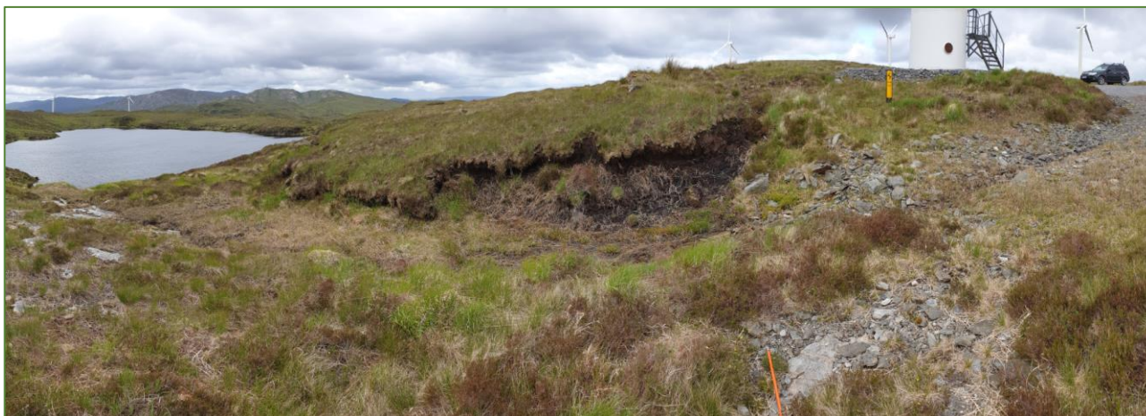
Plate 8.4: Example of Degraded Peat, Potentially Influenced by the Operational Barnesmore Windfarm