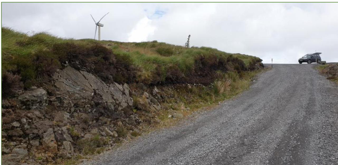
Plate 8.2: Example of Exposed Rock and Peat Adjacent to Existing Track (Scale: Road approx. 6m width, Orientation: Looking north, Site track leading to proposed T1 location)