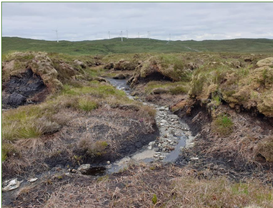
Plate 8.3: Example of Degraded Peat, with Obvious Natural Drainage Channel