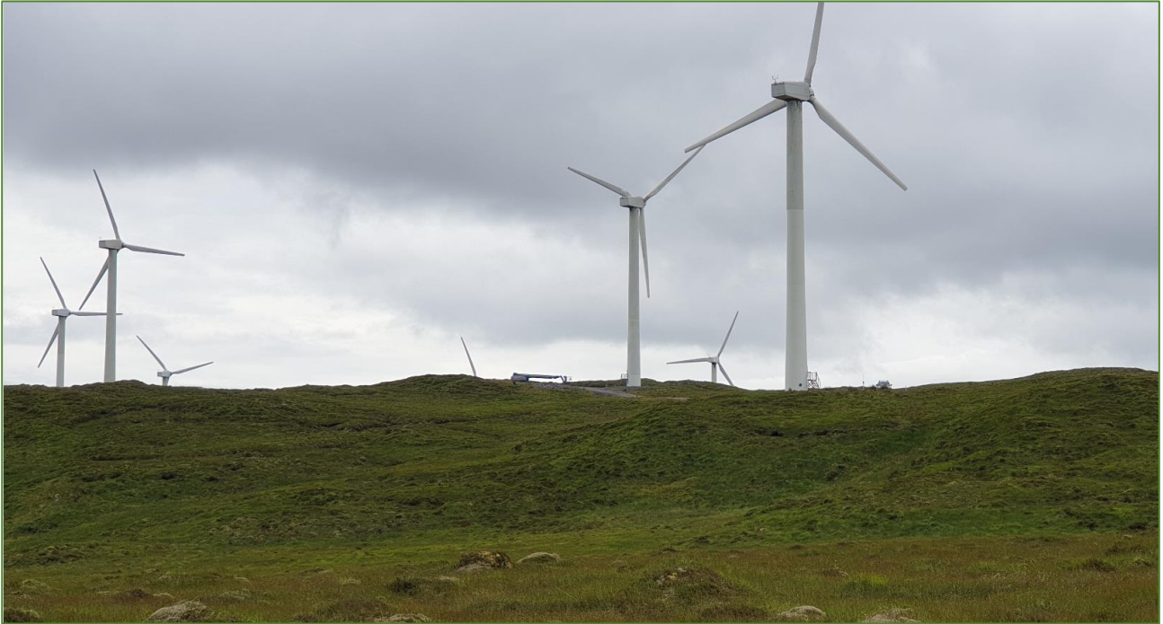
Plate 8.6: Linear features indicating potential for soil creep (Looking south at proposed location for T1)