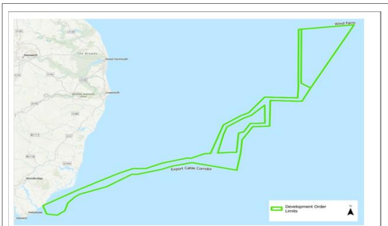
Figure showing Map/chart of the area: