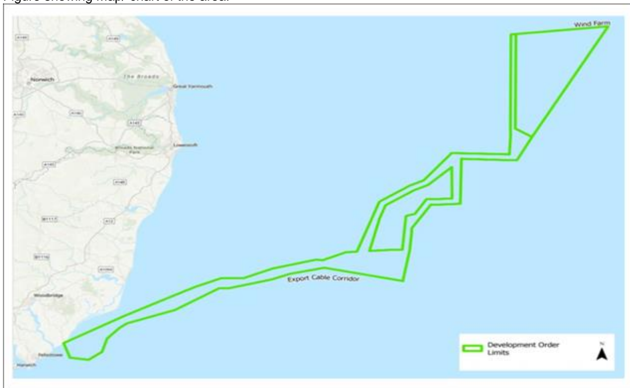
Figure showing Map/ chart of the area: