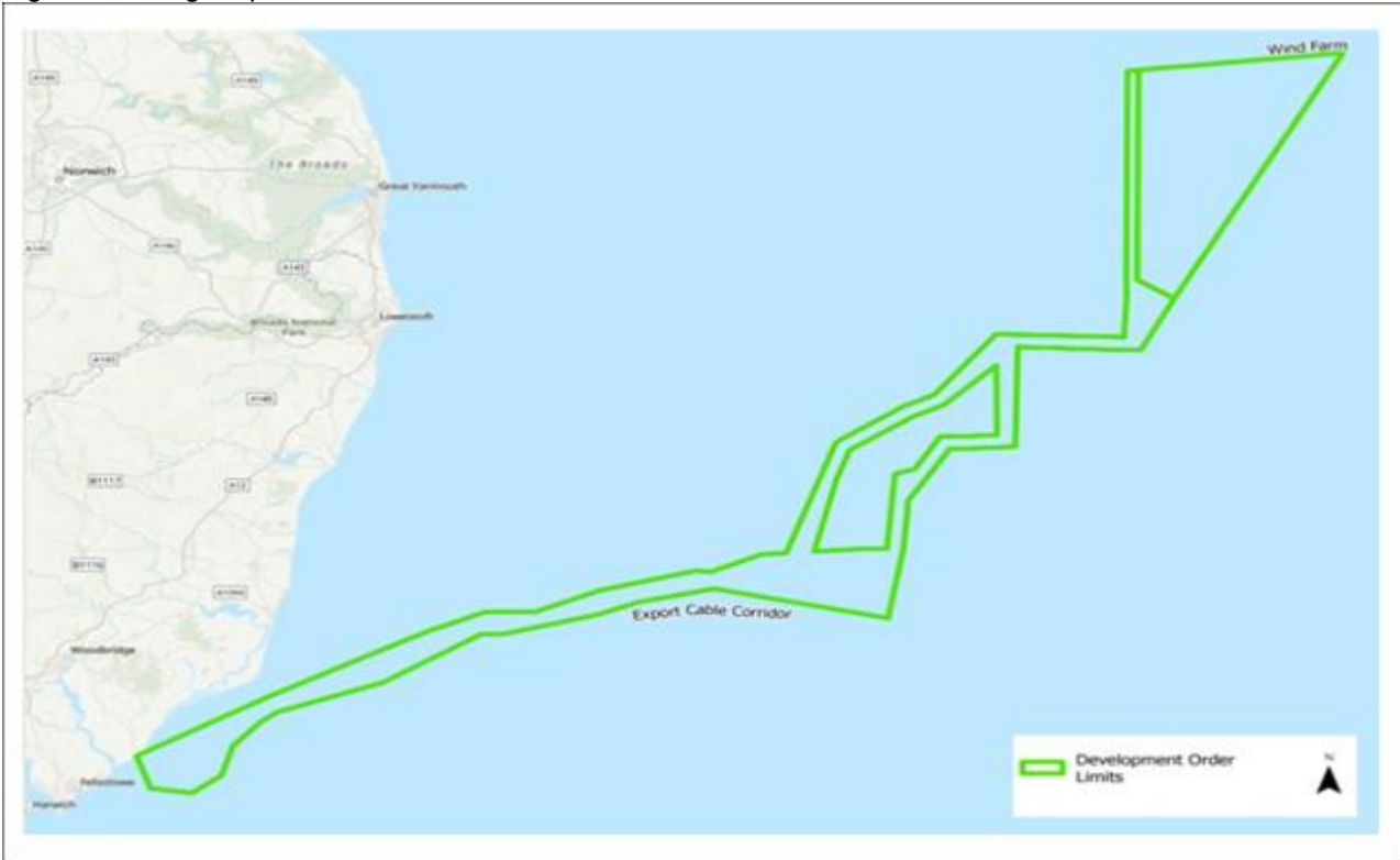
Figure showing Map/ chart of the area: