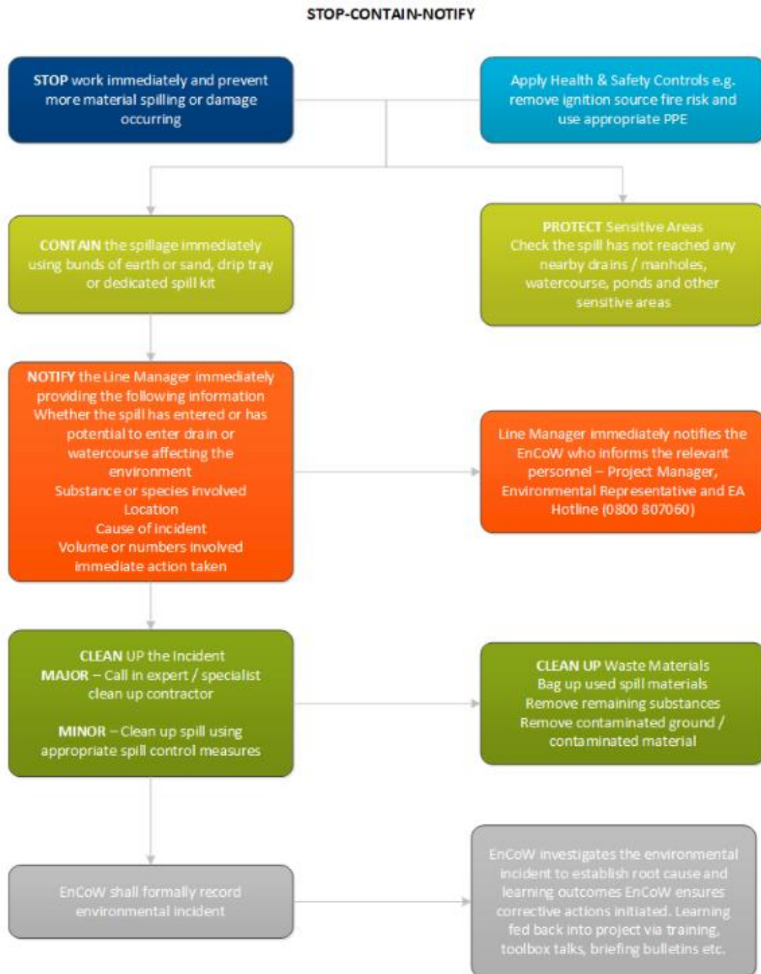
Figure 2 – Stop Contain Notify Matrix