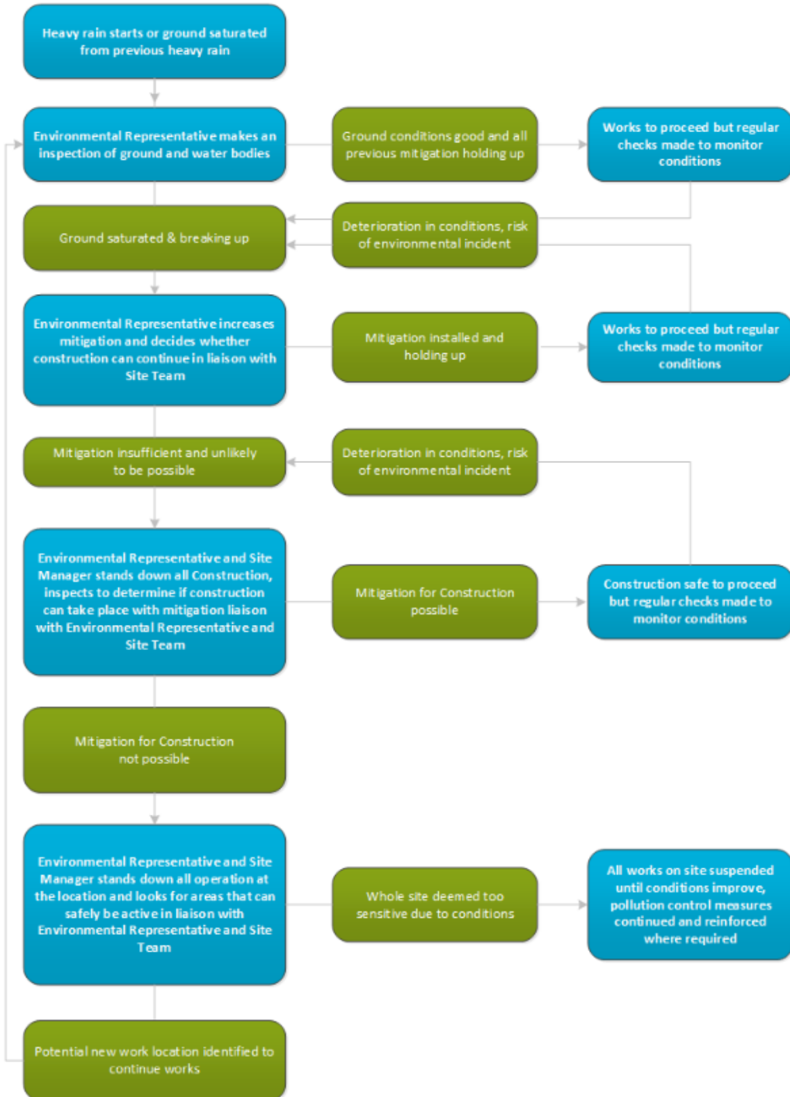
Figure 3 Wet Weather Decision Making Matrix